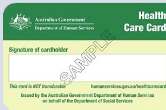
Health Care card