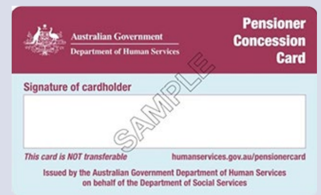
Pensioner Concession card

Pensen a la cangmi hna thilman thumhpiaknak kat